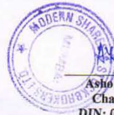
Ashok T Kukreja Chairperson DIN: 00463526

Place : Mumbai Dated : September 27, 2019